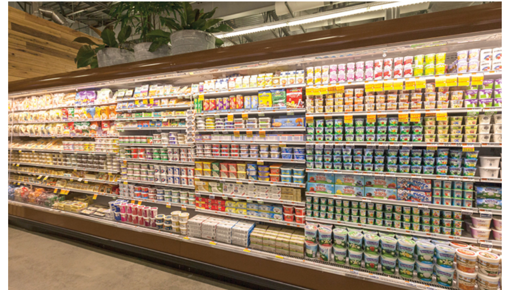
Dairy choices with bees