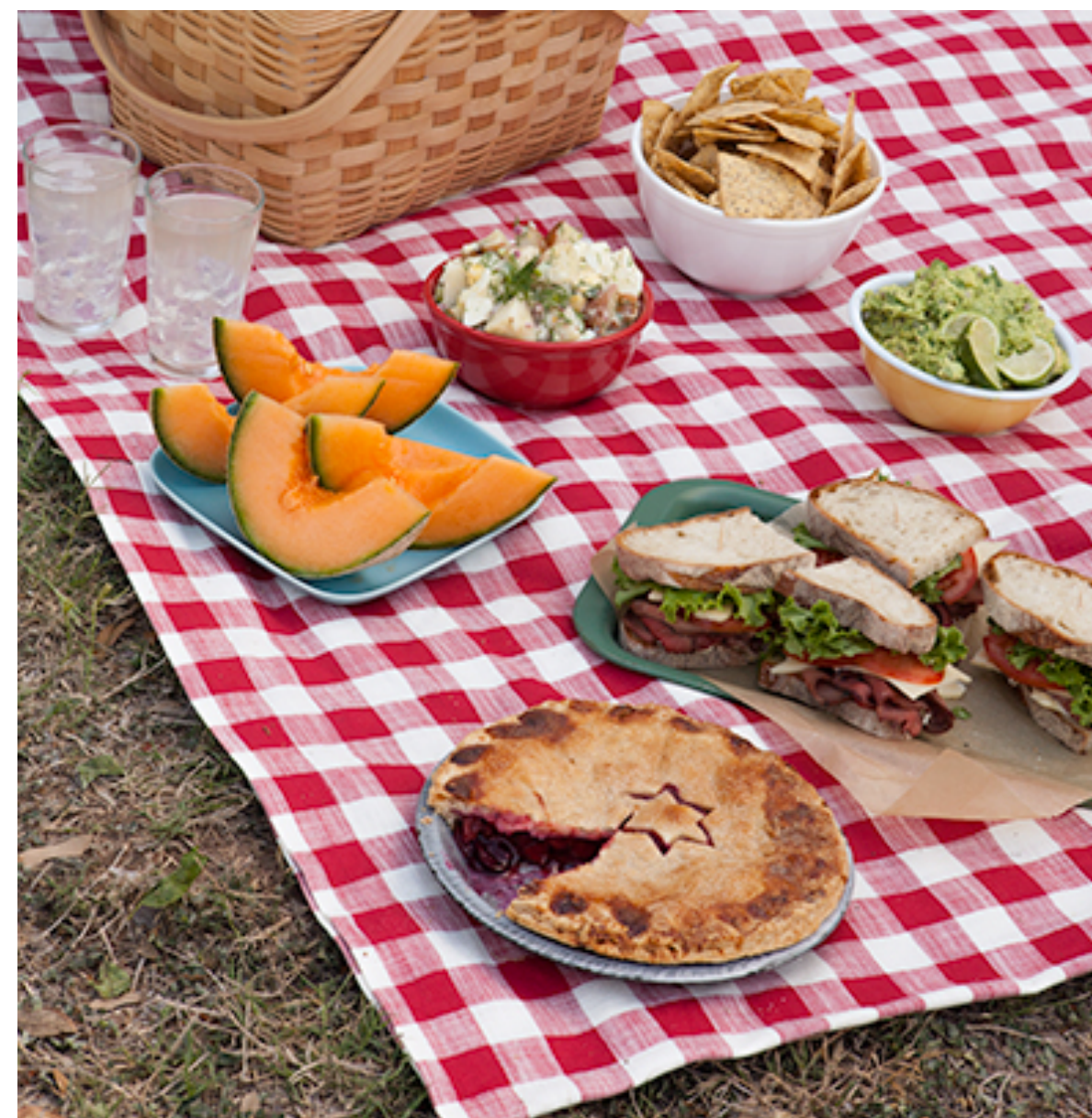
Picnic with bees