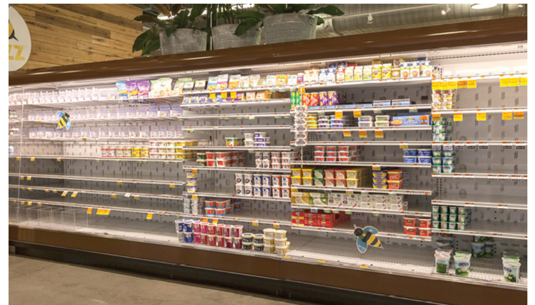
Dairy choices without bees