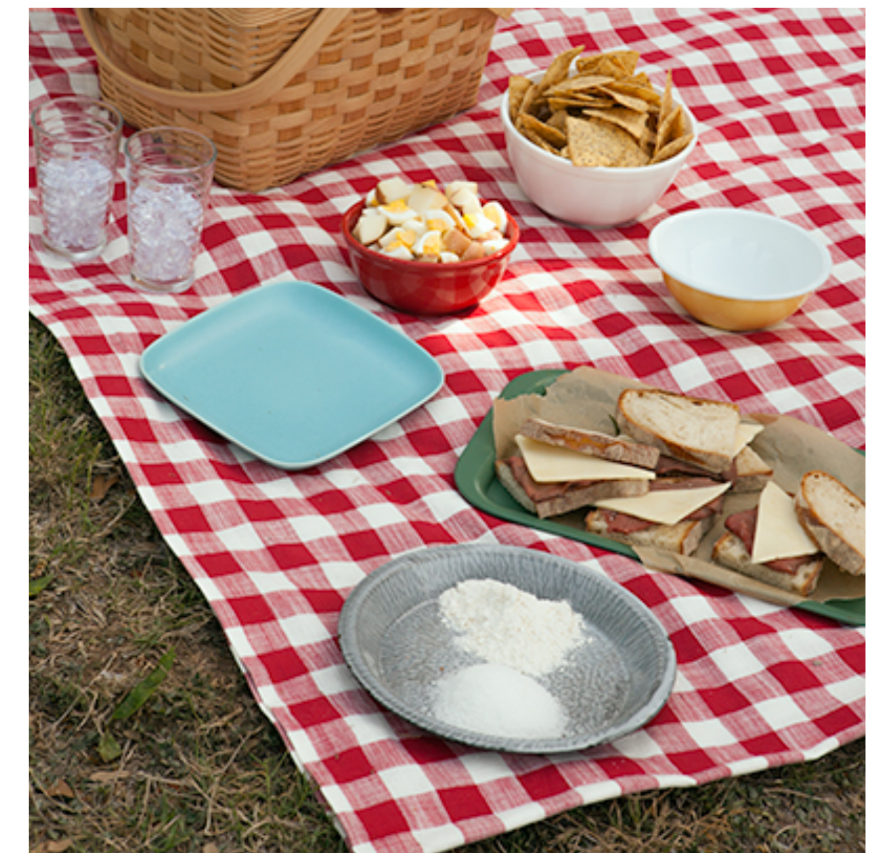
Picnic without bees